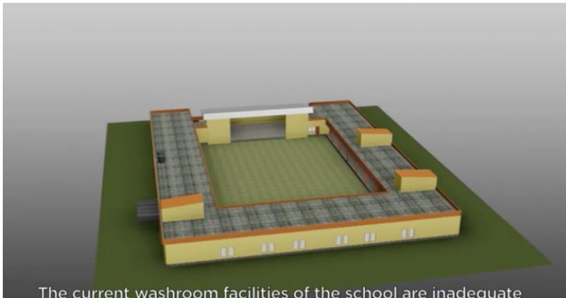
The current washroom facilities of the school are inadequate