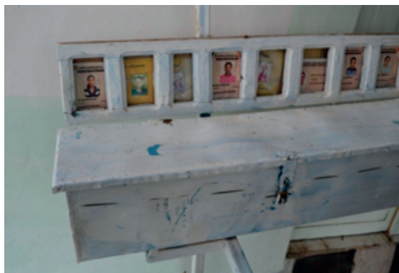
Comments box, outside the maternity ward

Alamata Hospital has made impressive improvements as a result of CASH. The energy and enthusiasm of the CEO was evident and this was crucial to the success of the programme. Feedback mechanisms, involving the community, have increased trust in the facility, which is seen by improvements in patient satisfaction and the increased patient load.