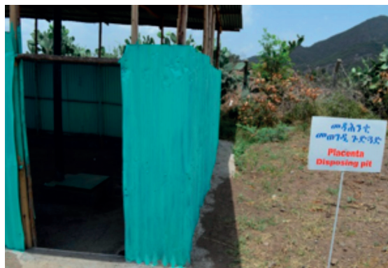
Waste management area, improved through CASH