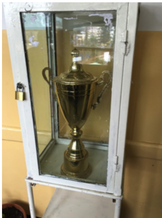
Award for best performing ward at Intensive Care Unit

Regular external audits enable facilities to be ranked against each other and high performing hospitals receive cleanliness awards. If quality is not maintained consistently, facilities can lose their ranking. The CEO of one district hospital felt that their cleanliness award and the competition between hospitals was one of the best incentives for staff to change their behaviour and make quality improvements. He reported that a higher ranking encouraged patients to access their services, improving revenue and enabling more investments into the facility. The National Quality Alliance also awards cash incentives for the best-performing hospitals. This is awarded to the hospital as a whole, which may use the money for any additional quality-related improvements that they wish.