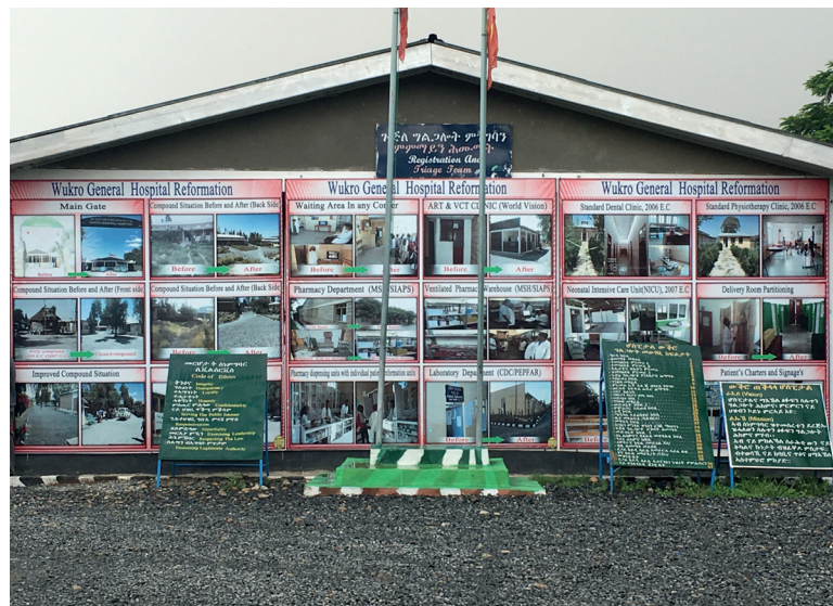
Improvements made at Wukro General Hospital

programme and expand it from hospitals to health centres and posts. In addition, to ensure greater sustainability of improvements, continued energy and commitment from the Government, as well as a clear and adequate budget, will be needed. This makes it critical to link WASH activities with the wider national quality effort with its stated emphasis on UHC.