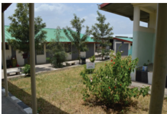
Alamata Hospital grounds

Alamata District Hospital is the second largest hospital in the Tigray Region, which saw 160 000 outpatients in 2015. It is rated in the top 10 hospitals nationally, and the third best performing nationally in terms of CASH. The budget for CASH was 500 000 Bir (US$ 22 600) in 2015 and rose to 990 000 Bir (US$ 44 800 USD) in 2016.