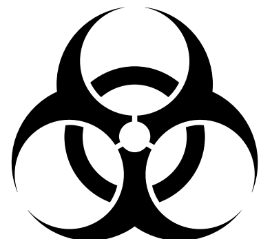
Figure 3.1 Biohazard symbol

Containers for infectious waste should not be placed in public areas because patients and visitors may use the containers and come into contact with