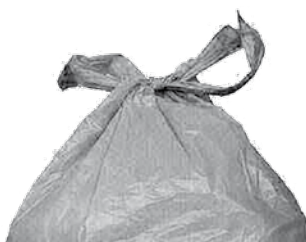
Figure 3.3 Exemplary bag tying

Waste bags/bins and sharp containers should be filled to no more than three-quarters full (or to the fill line on sharps bins when marked). Once this level is reached, they should be sealed, ready for collection. Plastic bags should never be stapled but may be tied in a knot or sealed with a plastic tag or tie. Replacement bags or containers should be available at each waste generation area.