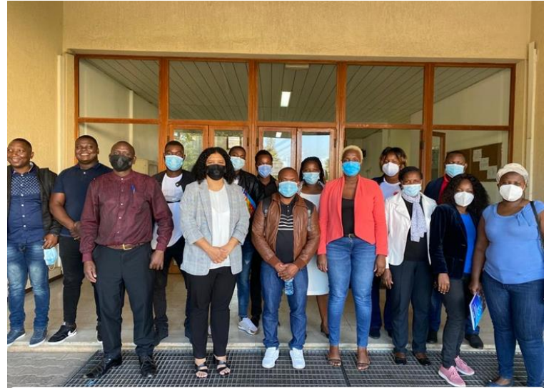
Training Participants, 13-15 July 2022, Maputo

Health Service of Maputo City organized a capacity building training on WASHFIT with technical and financial support of WHO in collaboration with Department of Environmental Health from Ministry of Health and UNICEF, from 13-15 July 2022. The training was organized in Maputo City, in the Tmcel conference Center. WHO/ UNICEF The overall purpose of this capacity building training was to create awareness and skill among the trainees, discuss integration of WASH FIT with ongoing WASH initiatives and programmes in health care facilities.